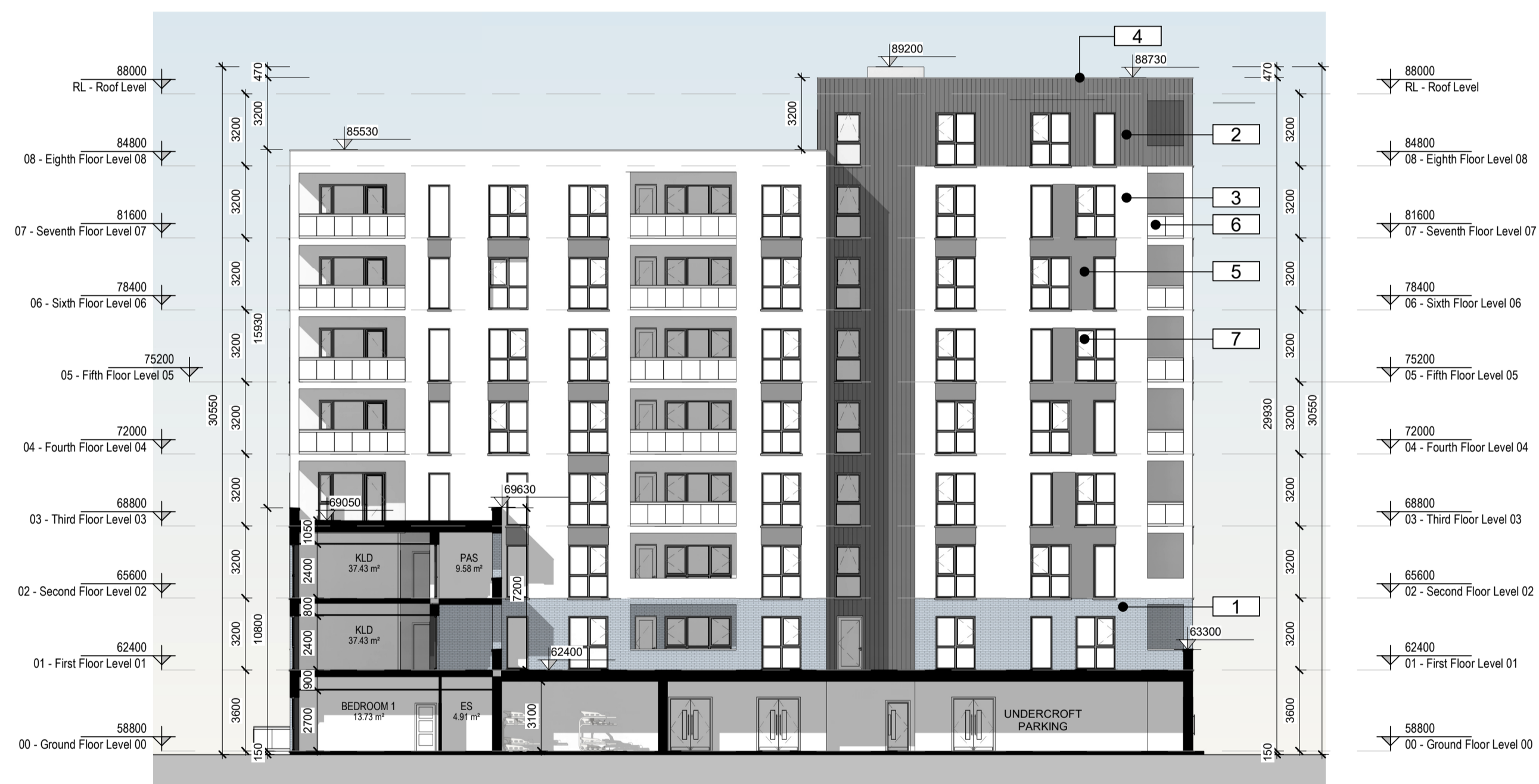
1 A5 BLOCK WEST ELEVATION