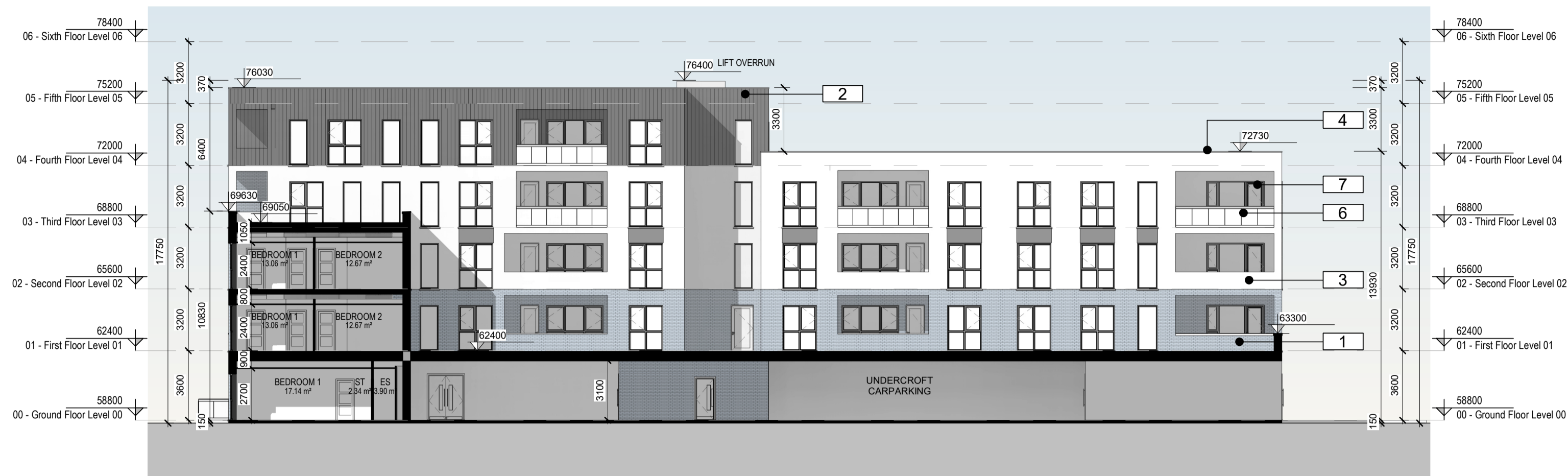
2 A3 BLOCK EAST ELEVATION

1 : 2500 SUBJECT HOUSE TYPE SHOWN IN COLOUR